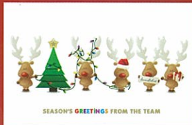
Reindeer Team FE627 178 x 117mm Heart Foundation