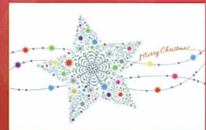
Twinkling Star ST643 178 x 117mm Heart Foundation