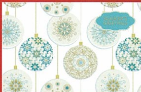
Glowing Baubles BA682 178 x 117mm National Breast Cancer Foundation