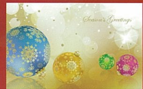
Elegant Baubles BA630 178 x 117mm Children's Cancer Institute