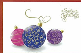
Gorgeous Baubles BA674 178 x 117mm Heart Foundation