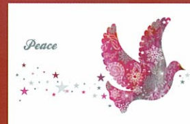
Magical Dove DO677 178 x 117mm Heart Foundation