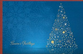
Glittering Tree TR613 178 x 117mm Children's Cancer Institute