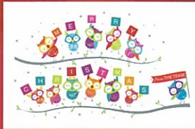
Christmas Hoot FE606 178 x 117mm National Breast Cancer Foundation

All our Christmas Cards mailed during November and December will only need a 65c stamp!