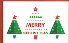
Festive Trees TR604 178 x 117mm Children's Cancer Institute