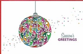
Jazzy Bauble BA646 178 x 117mm Children's Cancer Institute