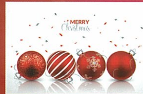
Sparkling Baubles BA659 178 x 117mm Heart Foundation