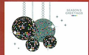
Shiny Baubles BA696 178 x 117mm National Breast Cancer Foundation