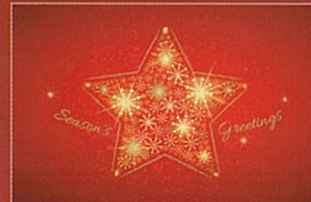
Shimmering Star ST625 178 x 117mm Children's Cancer Institute