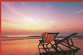
Sunset Christmas FE635 178 x 117mm National Breast Cancer Foundation