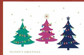
Pretty Trees TR683 178 x 117mm National Breast Cancer Foundation