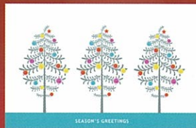
Silvery Trees TR641 178 x 117mm Heart Foundation