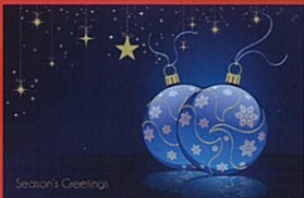
Midnight Baubles BA602 178 x 117mm National Breast Cancer Foundation