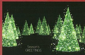
Emerald Trees TR670 178 x 117mm Heart Foundation