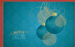
Delicate Baubles BA611 178 x 117mm Children's Cancer Institute