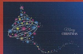
Vibrant Tree TR667 178 x 117mm National Breast Cancer Foundation